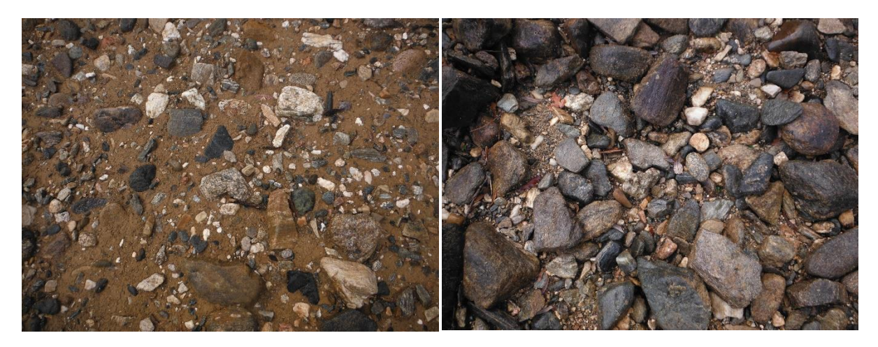
Picture 6: Filled up interstitial spaces downstream the mine (left) and natural substrate upstream the mine (right)