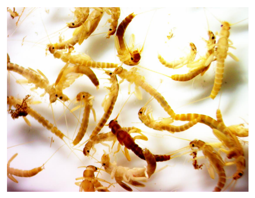
Picture 14: Stonefly larvae of family Leuctridae are the most numerous taxa in the samples and are among the animals which enter the interstitial during unfavourable conditions