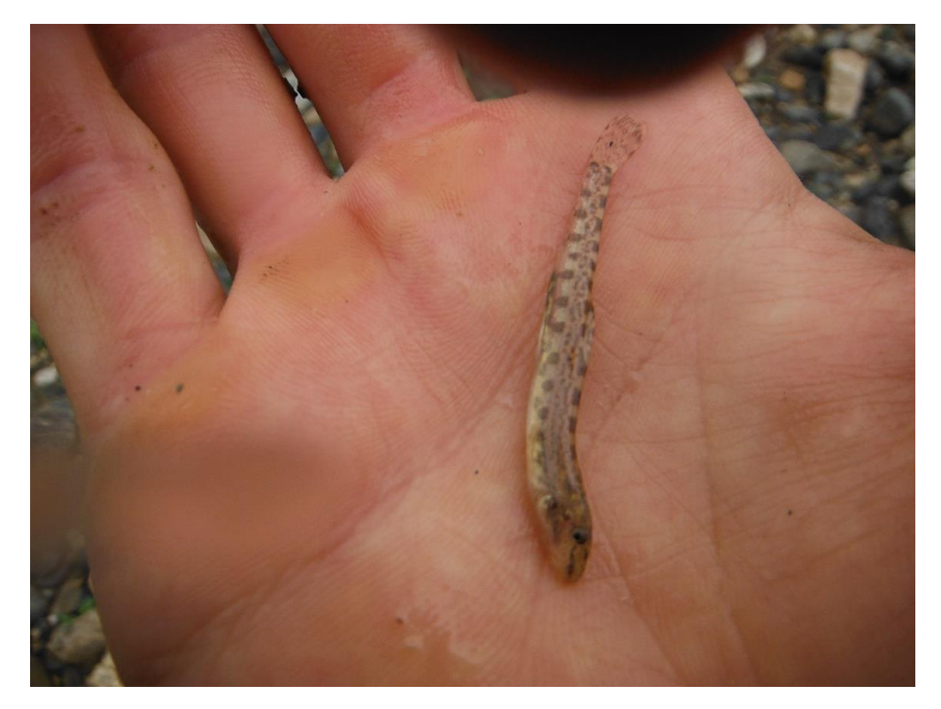
Picture 9: The balkan spined loach (Sabanejewia balkanica) together with the round-scaled barbel are included in Appendix 2 of the Habitats Directive