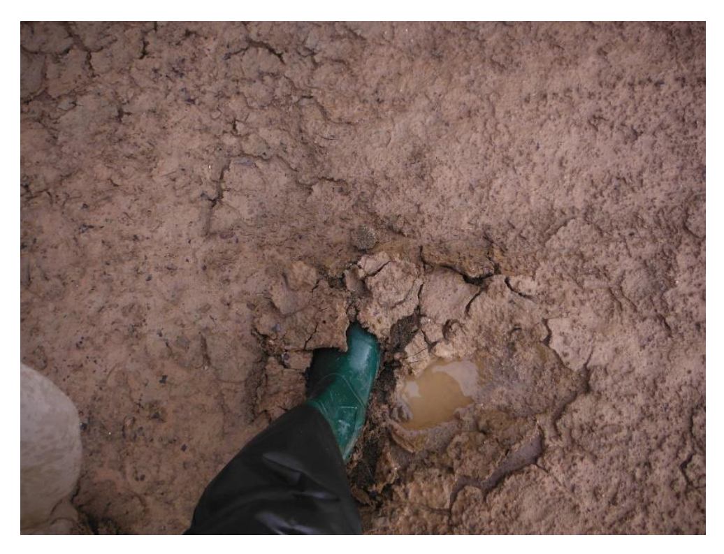
Picture 2: Deep layer of fine muddy sediments in the river bed caused by erosional flows coming from the mining area