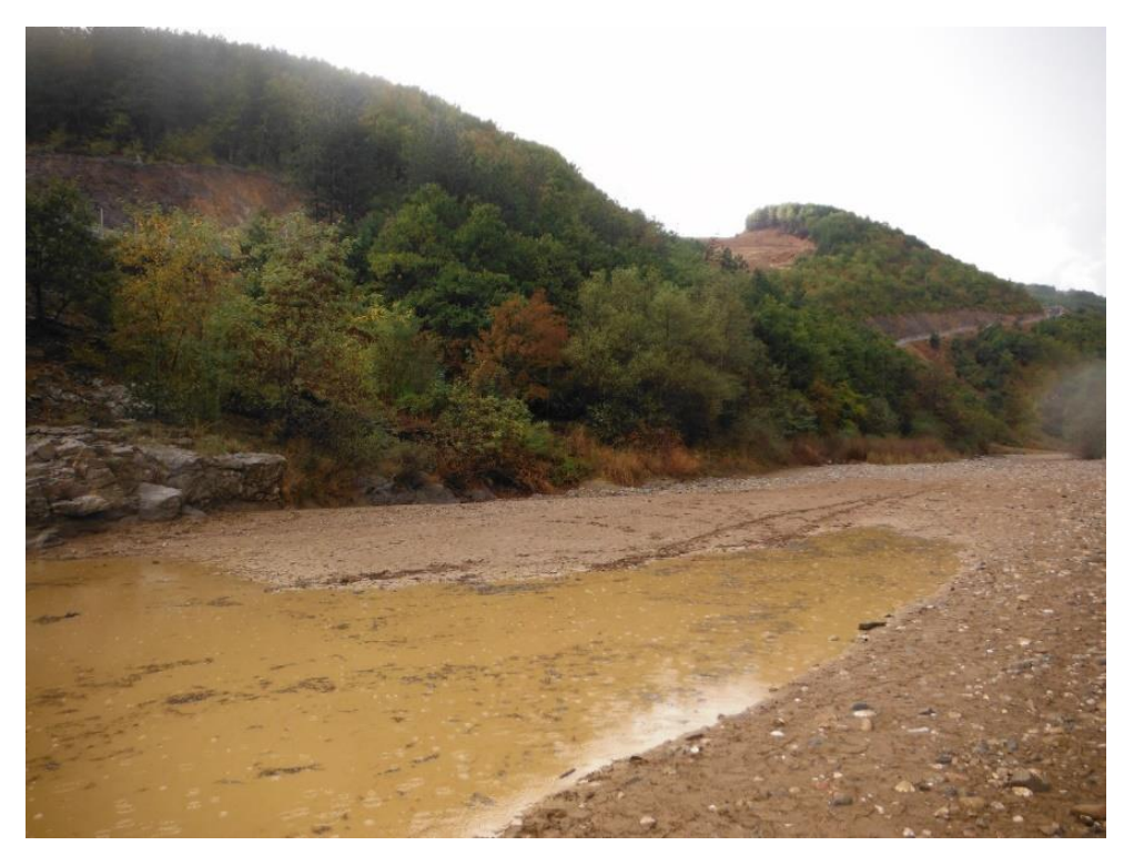
Picture 4: Formation of turbid water pools (from erosion flows) after rain