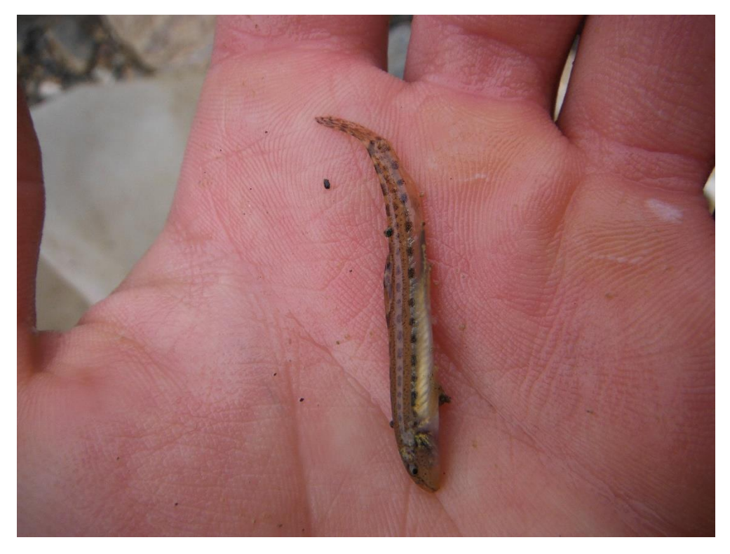
Picture 10: The bulgarian spined loach (Cobitis strumicae) is another endemic species (for the South-east Balkans) that inhabits the Krumovitsa river