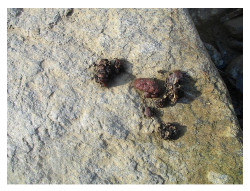
Picture 16: Otter (Lutra lutra) excrements were registrated along the studied section of Krumovitsa river