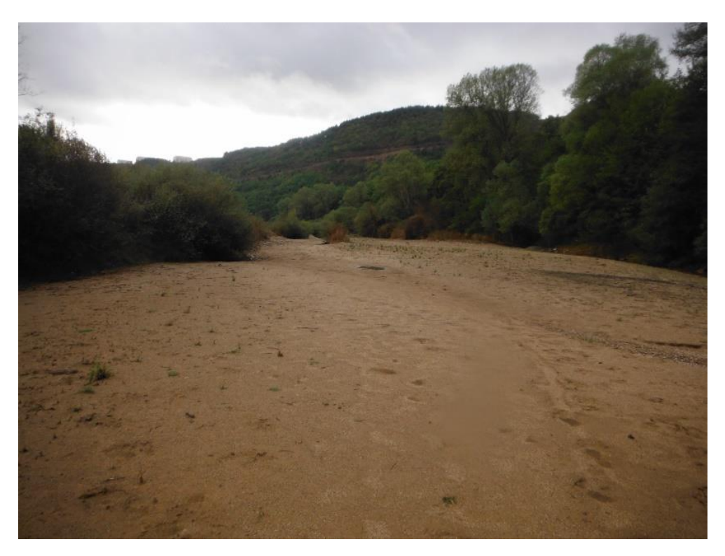
Picture 1: Dry river bed of Krumovitsa river downstream the mine, blanketed by sludge and mud