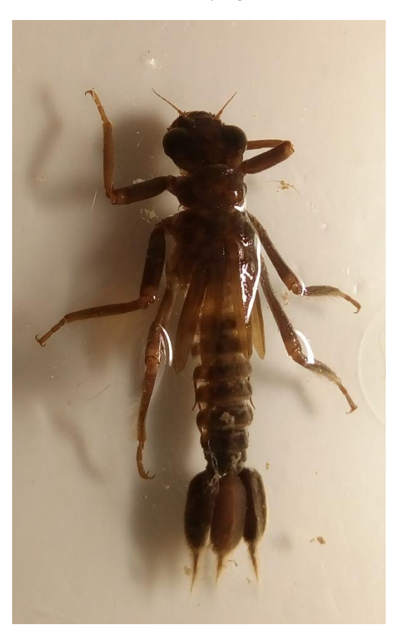
Picture 13:The white-legged damselfly larvae (Platycnemis pennipes) is a relatively large predator that inhabit the river bottom