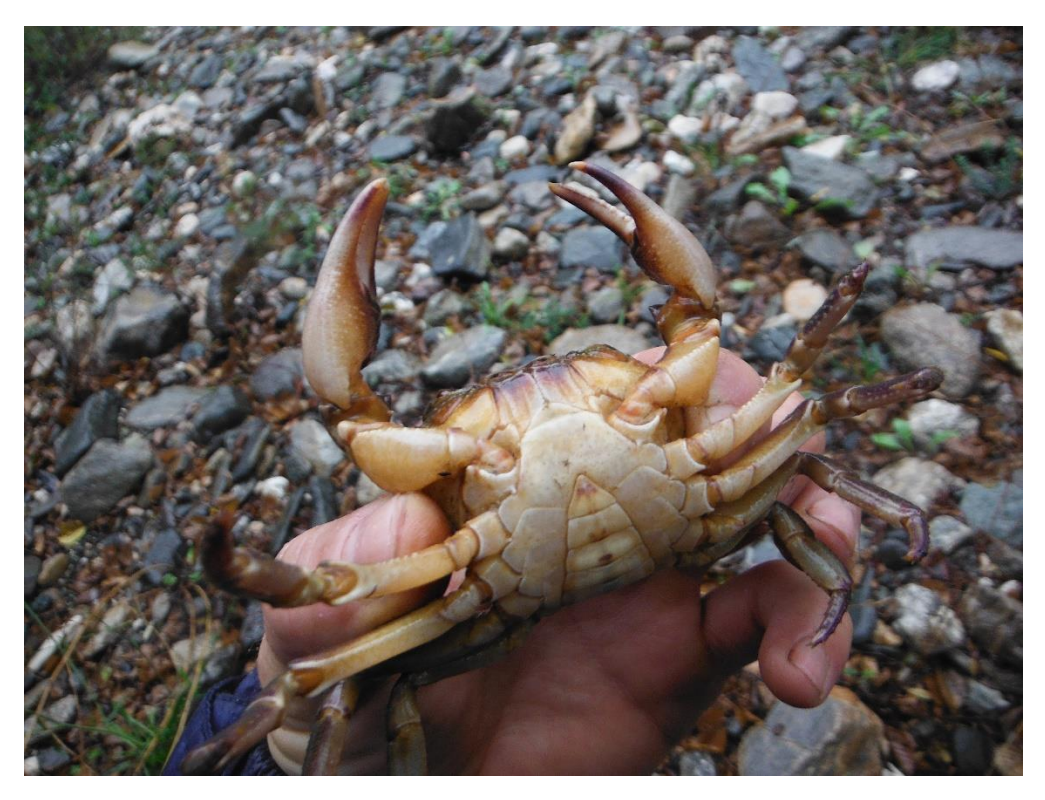
Picture 7: The freshwater crab (Potamon ibericum) is typical for sub-mediterranean rivers and it is widespread along Krumovitsa river.