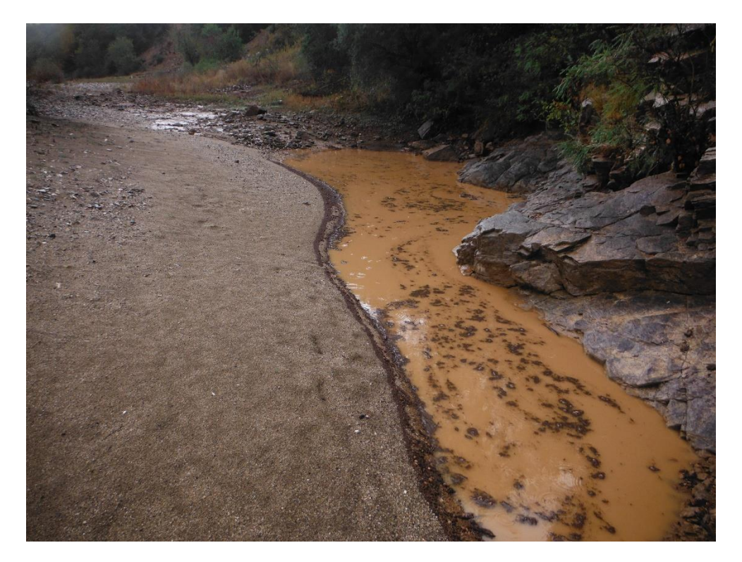
Picture 5: Upstream of this pool the river is not affected by the erosional flows coming from the mining area