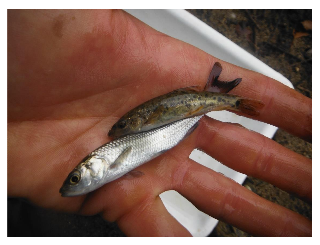
Picture 8: The orpheus dace (Squalius orpheus) and the round-scalled barbel (Barbus cyclolepis) are dominant fish species in Krumovitsa river