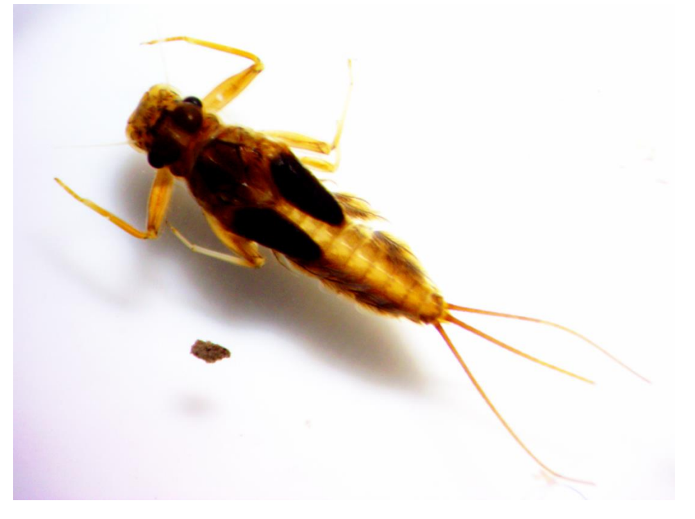
Picture 15: The mayfly larvae Habrophlebia cf marginata is also entering the interstitial but can spend the draughts in the stagnate pools as well