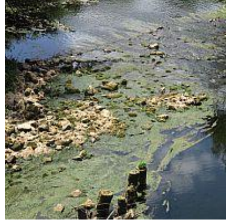
When the HPP doesn't work

This is happening in a Natura 2000 Habitats Directive site without an EIA/AA, remember?