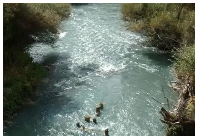
When the HPP is working

That happened in the end of 2016 and we are in the end of 2018 now and the river is running in deeper shades of blue today and smells many times worse! But it doesn't run full time, because the HPP uses 8 /eight/ cubic meters per second and then it needs to stop working from time to time in order for the dam to be filled again to the top - the effect is called hydropeaking . Here are two pictures of one and the same river section: